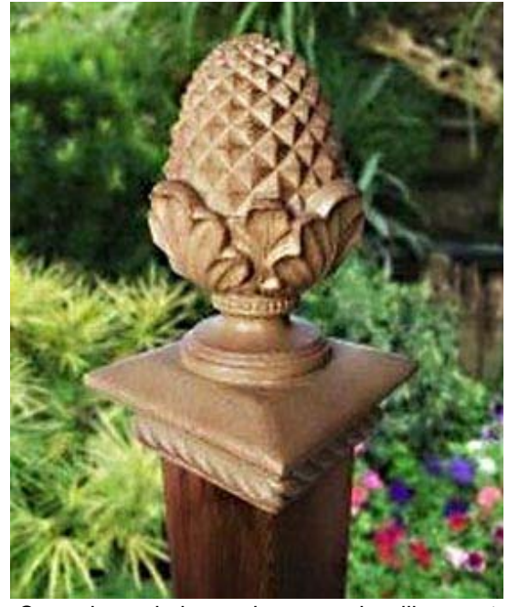
Carved wood pineapple on porch railing post

never be invited anywhere again. The pineapple was so rare and esteemed that if the host did not have one in fruit in his "pinery", he would rent one from some one who did. It became such a symbol of importance and wealth that a method of "candying" pineapples was developed to preserve them. It took the cooks so many changes of syrup that 10 weeks were required to complete the preserving process. It was evidently