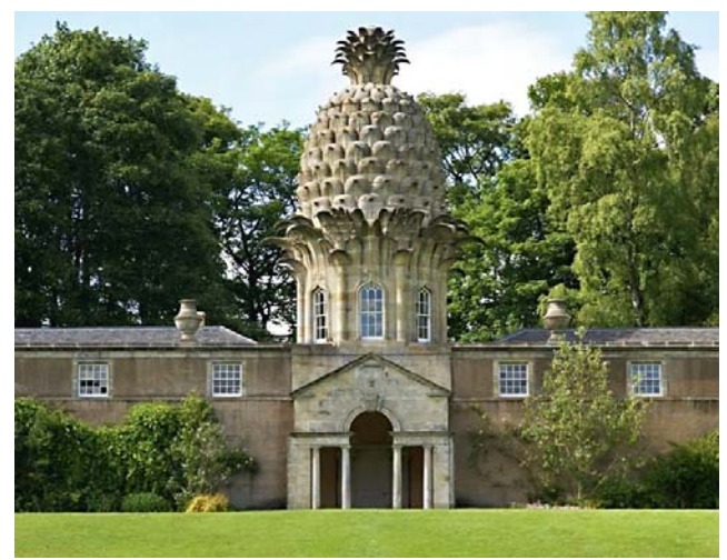
Dunmore House - Scotland's 'Folly'

I am sure that none of this interesting information will help you to grow the ananas successfully, but if anyone wants to rent a pineapple, just call me. Members of the New York Bromeliad Society will receive a 25% discount.