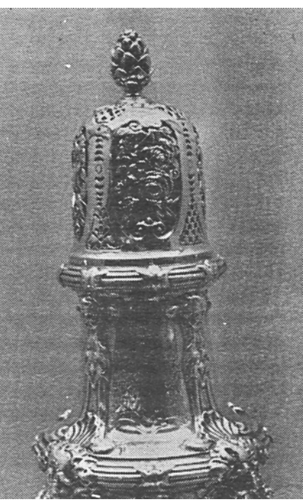
Silver urn with pineapple on top cover. London, 1740

Fruits" and stated that the production of pineapples "has become the test of good gardening".