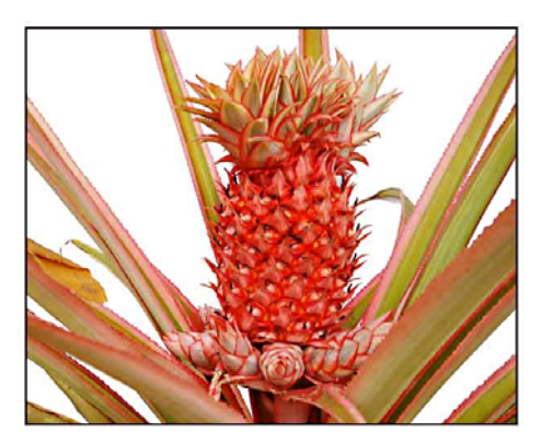
Variegated Ananas 'Comosus' with multiple basaland apical offsets

The pineapple is a multiple fruit; each flower in the inflorescence produces a fruit, but these mature into a single mass in which each flower has produced a true fruit. After flowering the mass is called an infructescence. Examples are the fig, pineapple, mulberry, osage-orange, and breadfruit. Pineapple fruits frequently turn bright red during the flowering/fruiting process.