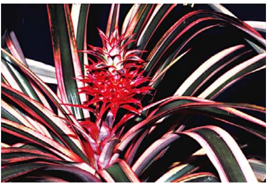
Ananas (comosus) 'Ivory Coast'

Some striking ornamental pineapple plants have been produced such as the variegated, spineless Ananas 'Ivory Coast' shown below.)